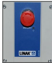
Emergency lowering button